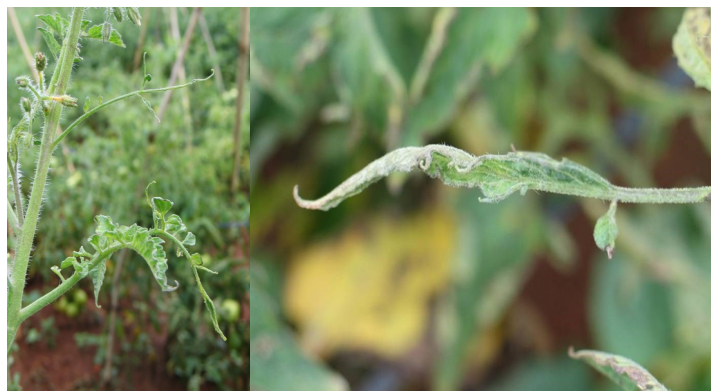
Figure 1. Shoestring leaf distortion symptoms of Cucumber mosaic virus (CMV) infection of tomato.

Cucumber mosaic, caused by the Cucumber mosaic virus (CMV), occurs in tomato production areas throughout the world, but it is mostly important in temperate growing regions. The most characteristic symptoms of CMV infection is the shoestring distortion of leaves, where the leaf blades do not expand, leading to thin, narrow leaves (Figure 1). 1 Infected plants are somewhat chlorotic (light green to yellow), bushy, and stunted. Leaves can also show mosaic symptoms, which may develop on the top (young) and bottom (older) leaves, while the middle leaves appear healthy. 2,3 The fruit produced on CMV infected plants are usually smaller than normal, and they may appear mottled and/or have brown patches. 1 There are several different strains of CMV that produce somewhat different symptoms.