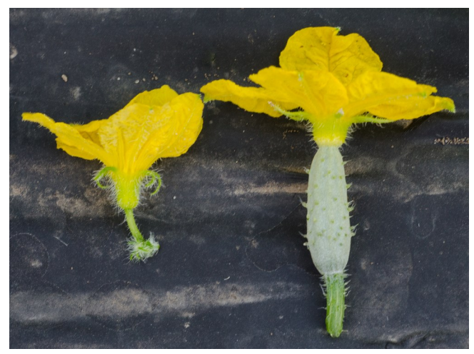
Figure 1. Male (left) and female (right) cucumber flowers.

Cucumbers, like most cucurbit plants, produce separate male and female flowers on the same plant (Figure 1). In botanical terms, these plants are said to be monoecious (translation, one-house). On monoecious plants, the male flowers contain stamens that produce pollen, while female flowers have pistils that contain the ovule. By contrast, plants, such as tomatoes and beans, produce "perfect" flowers that have both male and female parts present in the same flower.