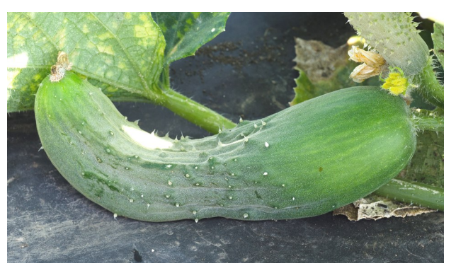
Figure 2. Inadequate pollination results in fruit abortion or the formation of misshapen fruit.

As the fertilized ovules develop, hormones are released that stimulate the division and expansion of fruit cells. The development of cucumber fruit usually depends on the